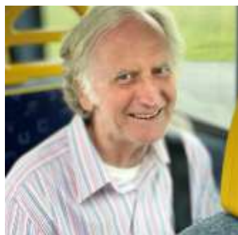
Dartmoor day at Coppelia - on page 3