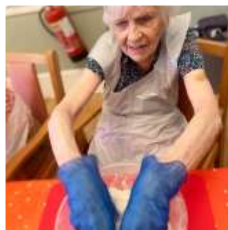
Cooking club at Parkland - on page 5