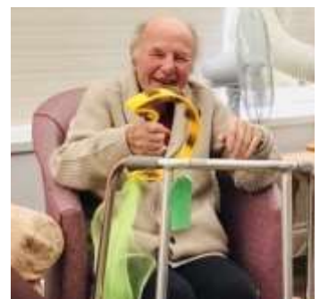
Music at Plymbridge - on page 6