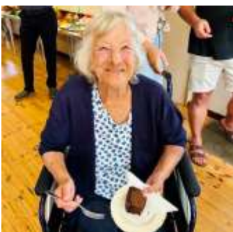
Denbury show at Bramble Down - on page 2

Including Above & Beyond Awards nominations, training in focus and a chef get together.